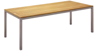
5433 101cm x 220cm TEAK TABLE

Powder coated aluminium frame. Frame Colours : Tungsten / Slate Natural finish slatted teak table top. Without parasol hole. Seats 6