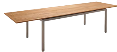
4541 LARGE EXTENDING TABLE

Powder coated aluminium frame. Frame Colours : Tungsten / Slate Natural finish slatted teak table top. Self-storing butterfly extension system. Without parasol hole. Seats 6-10