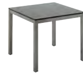
5414 87cm SQUARE HPL TABLE

Powder coated aluminium frame. Frame Colours : Tungsten / Slate Natural finish slatted teak table top. Without parasol hole. Seats 8