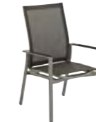
595 RECLINING CHAIR WITH ARMS

Powder coated aluminium frame. Frame Colours : Tungsten / Slate Sling seat & back.