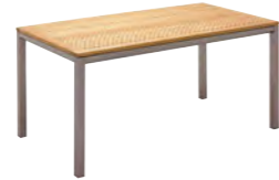
5423 87cm x 160cm TEAK TABLE

Powder coated aluminium frame. Frame Colours : Tungsten / Slate Natural finish slatted teak table top. Without parasol hole. Seats 4