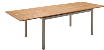
4531 SMALL EXTENDING TABLE

Powder coated aluminium frame. Frame Colours : Tungsten / Slate Black HPL table top. Without parasol hole. Seats 8