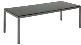
5434 101cm x 220cm HPL TABLE

Powder coated aluminium frame. Frame Colours : Tungsten / Slate Black HPL table top. Without parasol hole. Seats 6