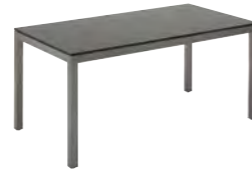
5424 87cm x 160cm HPL TABLE

Powder coated aluminium frame. Frame Colours : Tungsten / Slate Black HPL table top. Without parasol hole. Seats 4