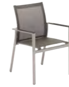
540 STACKING CHAIR WITH ARMS