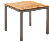
5413 87cm SQUARE TEAK TABLE