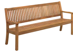
218 192cm BENCH

W · 192 D · 61 H · 90.5 SH · 43.5 AH · 65