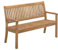
963 133cm BENCH

ACCESSORIES C01 : ..... Seat Pad Cushion