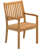
811 DINING CHAIR WITH ARMS

W · 55 D · 61 H · 90.5 SH · 43.5 AH · 64.5