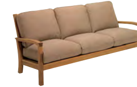
1913 3-SEATER SOFA

W · 209 D · 93 H · 87.5 SH · 51.5 AH · 60.5