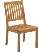
812 DINING CHAIR

ACCESSORIES C04 : ..... Seat Pad Cushion