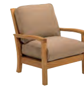
1910 LOUNGE CHAIR

W · 78.5 D · 93 H · 87.5 SH · 51.5 AH · 60.5