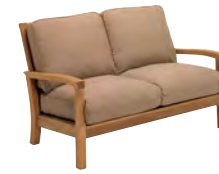
1912 2-SEATER SOFA

W · 144 D · 93 H · 87.5 SH · 51.5 AH · 60.5