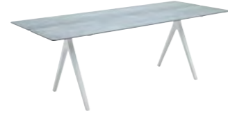
8141 92cm x 220cm CERAMIC TABLE

Powder coated aluminium frame. Frame Colours : White / Meteor Pumice colour ceramic table top. Without parasol hole. Seats 6