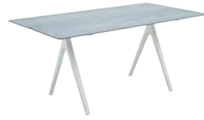
8131 92cm x 170cm CERAMIC TABLE

Powder coated aluminium frame. Frame Colours : White / Meteor Buffed finish slatted teak table top. Without parasol hole. Seats 10