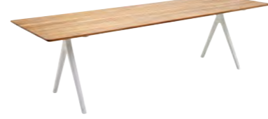
8150 92cm x 280cm TEAK TABLE

Powder coated aluminium frame. Frame Colours : White / Meteor Buffed finish slatted teak table top. Without parasol hole. Seats 8