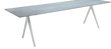
8151 92cm x 280cm CERAMIC TABLE

Powder coated aluminium frame. Frame Colours : White / Meteor Pumice colour ceramic table top. Without parasol hole. Seats 8