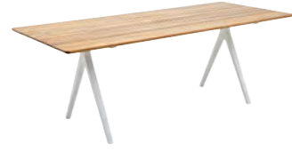
8140 92cm x 220cm TEAK TABLE

Powder coated aluminium frame. Frame Colours : White / Meteor Buffed finish slatted teak table top. Without parasol hole. Seats 6