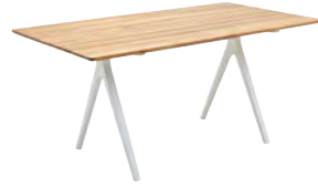
8130 92cm x 170cm TEAK TABLE