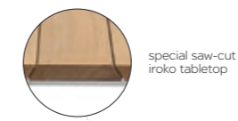
special saw-cut iroko tabletop