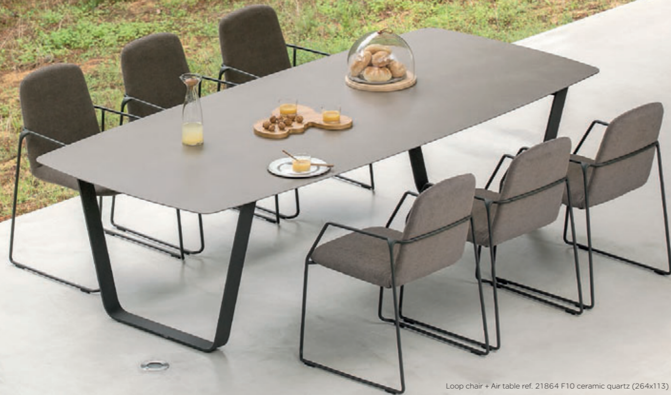
Loop chair + Air table ref. 21864 F10 ceramic quartz (264x113)