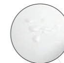
upholstery with nautic finishing