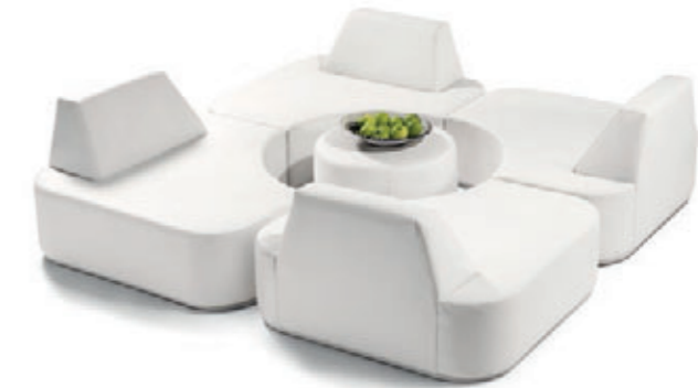
Moon Island concept 2